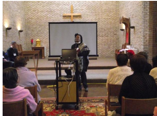
Below: attendees attentively watching excerpts of the Jewish culture