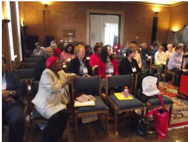
Above: The opening service with everyone in the chapel